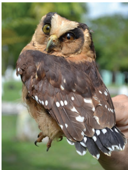
Figure 2. Heterochromia iridis in Buff-fronted Owl Aegolius harrisii at Parque dos Falcões, Itabaiana, Sergipe, Brazil (Juan Ruiz-Esparza)

A. harrisii appears to be relatively rare, and is poorly known in museum collections (Studer & Teixeira 1994, Marks et al. 1999), which hampers systematic analysis of its biology or distribution. The available records do, however, suggest that the species is uncommon and patchily distributed (Stotz et al. 1996). While few records are available from north-east Brazil, mainly from Ceará (Table 1), they indicate that the species is perhaps adapted to the arid Caatinga , and may be a habitat generalist. The present record, together with other