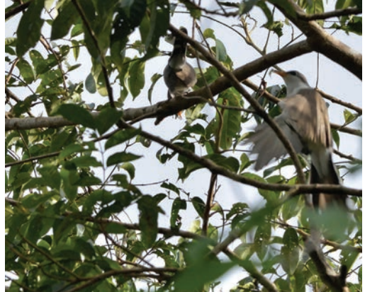
Figure 2. Pearly-breasted Cuckoo Coccyzus euleri , Risquetout forest, Macouria, French Guiana, 10 August 2013 (F. Royer)

Figure 3. Male Pearly-breasted Cuckoo Coccyzus euleri holding something in its bill and perching beside the female, just prior to copulation, 'Guatemala', Macouria, French Guiana, 14 August 2013 (F. Royer)