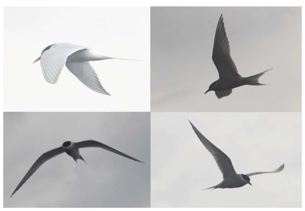
Figure 2. Antarctic Tern Sterna vittata , at sea off Rio Grande do Sul, Brazil (c.34°07.3′S 51°18.7′W), 3 September 2012 (Nicholas W. Daudt)