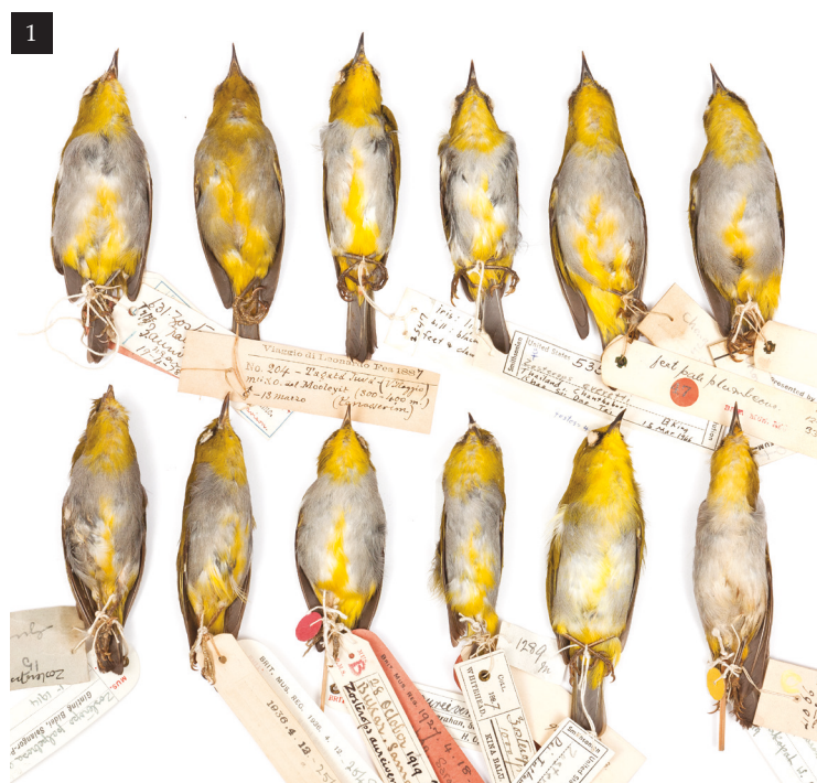
Figures 1–2. The Zosterops auriventer grouping and neighbours, in ventral and dorsal views. Top row in each, left to right: auriventer (Tavoy, Tenasserim; holotype); auriventer (Mulayit, Dawna Range, Tenasserim); two wetmorei (Soi Dao Tai peak, south-east Thailand); two wetmorei (Trang, Peninsular Thailand); bottom row: two tahanensis (Main Range, Peninsular Malaysia); medius (Sadong peak, south-west Sarawak, Borneo; holotype); medius (Mount Kinabalu, Sabah, Borneo; holotype of parvus ); Z. palpebrosus siamensis (Doi Inthanon peak, north-west Thailand); Z. palpebrosus williamsoni (Ra Island, Peninsular Thailand)