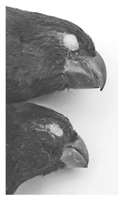
Figure 2. Comparison of bill size between Cuban Bullfinch Melopyrrha n. nigra of Cuba (lower bird) and M. n. taylori of Grand Cayman (upper bird), United States National Museum, Smithsonian Institution, Washington DC

Although adult males of both forms are essentially uniform black with some white on the primaries, pattern and coloration are inconsistent, and are quite different in females and immatures. Adult male M. n. nigra is more lustrous or glossy black overall, with a violet sheen. In contrast, M. n. taylori is duller with no gloss. The two populations show differing amounts of