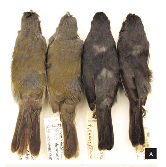
Figure 3. Comparison of plumage coloration between female Cuban Bullfinch Melopyrrha nigra taylori of Grand Cayman (left two individuals) and Melopyrrha n. nigra of Cuba (right two individuals): (A) upperparts, (B) lateral view, (C) underparts, United States National Museum, Smithsonian Institution, Washington DC (James W. Wiley)

Although formerly considered common on Grand Cayman, the bullfinch's range has been reduced and it is now rare to absent west of Savannah due to urban development and loss of habitat due to forest clearance and hurricanes. East of Savannah, it is a locally common resident breeding mainly in dry forest within the protected Botanic Park and Mastic reserve, and in shrubland and woodland in the north and east where continued development threatens habitats (Bradley 2000, Bradley & Rey-Millet 2013). It bred infrequently in mangroves but since Hurricane Ivan (2004) breeding has not been observed in mature black (Avicennia germinans), white