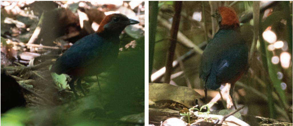
Figure 1A–B. Tabar Pitta Erythropitta splendida , southern Tabar Island, New Guinea, 31 July 2016 (Markus Lagerqvist)