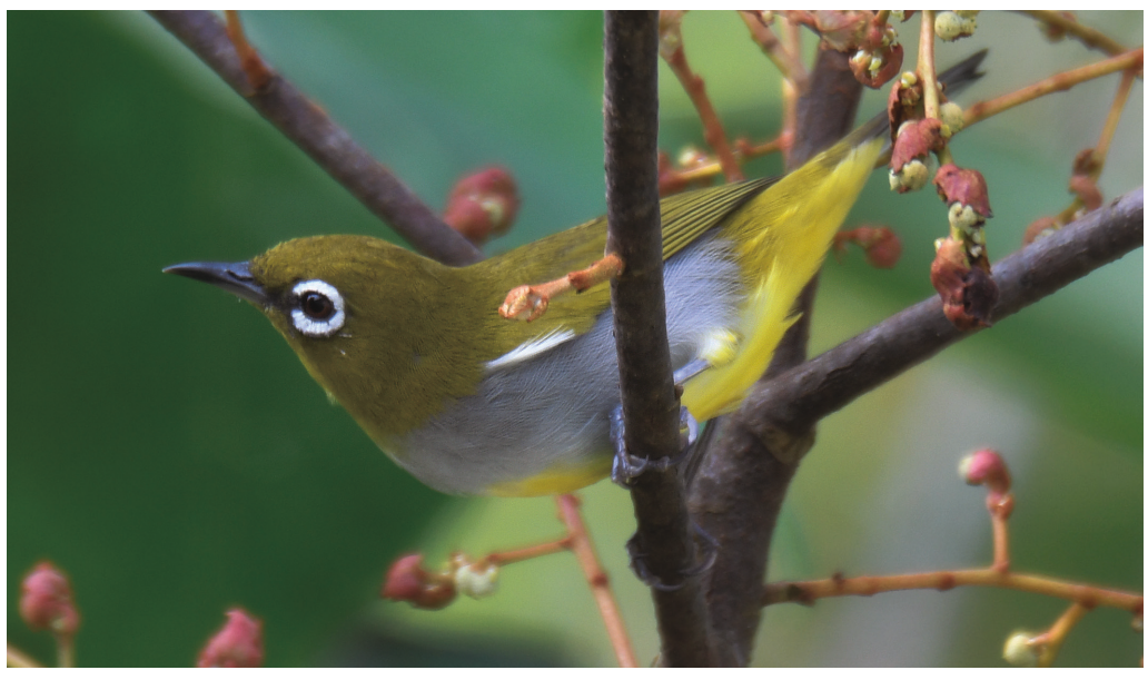
Figure 2. Zosterops 'tahanensis', Keledang Sayong Forest Reserve, inland Perak state, Peninsular Malaysia; differs from nominate auriventer (which is unknown in life) only by average measurements (see Wells 2017, this issue)