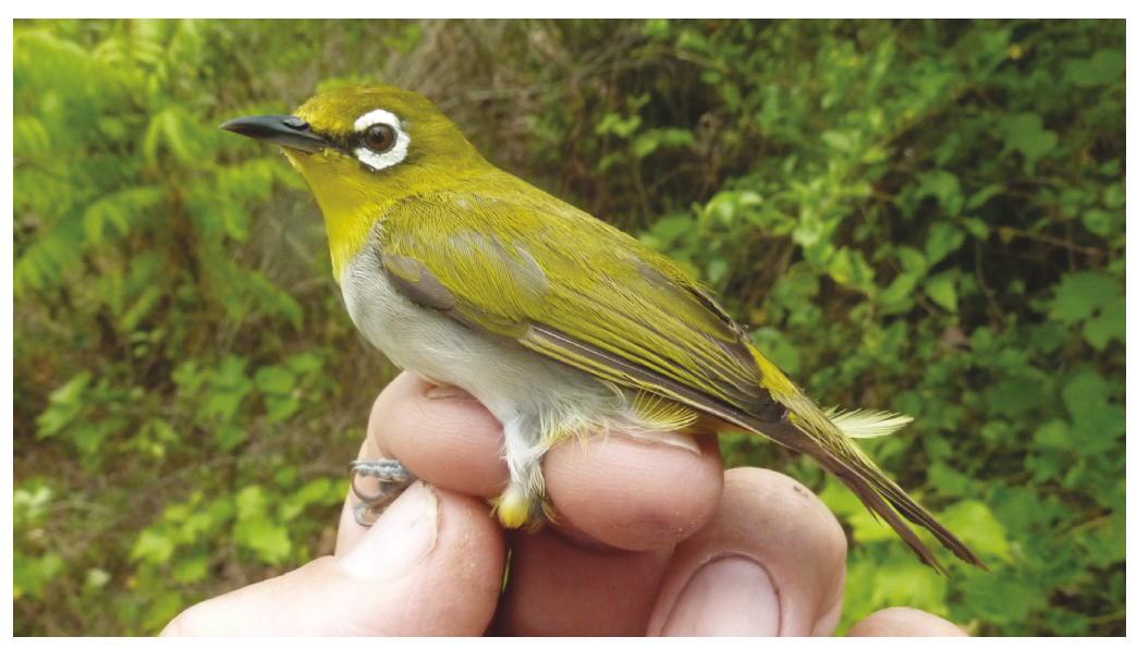
Figure 1. Zosterops (palpebrosus) 'auriventer' (= erwini) , mangrove zone, Khlong Thom district, Krabi Province, peninsular Thailand, i.e., at the proven end-point of erwini range closest to the type locality of nominate auriventer