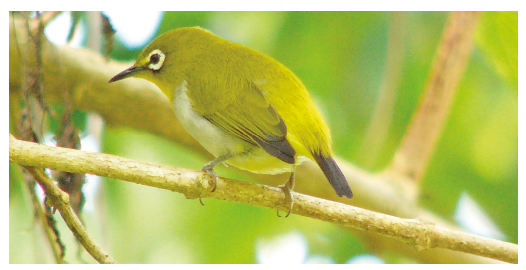
Figure 3. Unidentified coastal white-eye, Damai, Santubong Peninsula, south-west Sarawak, western Borneo