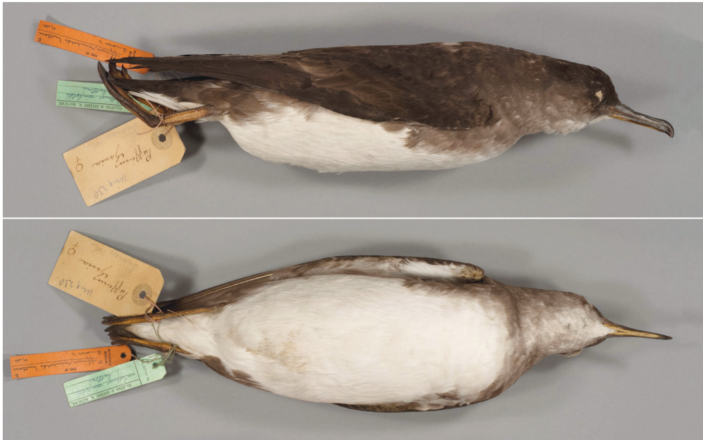
Figure 1. The holotype of Hutton's Shearwater Puffinus huttoni Mathews, 1912; AMNH 527761

be Fluttering Shearwater AMNH 527762, which is also a Dannefaerd bird, from 'New Zealand Seas' and labelled ' Puffinus reinholdi huttoni ' in an unknown hand.